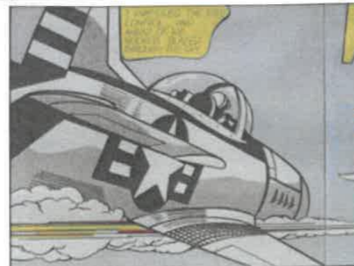
Roy Lichtenstein - WHAAM! (1963)

Advancing: Summarise the reasons why Pop artists were inspired to create their style of art.