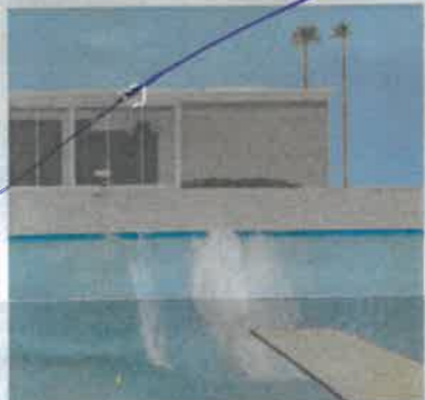
David Hockney - A Bigger Splash (1967)