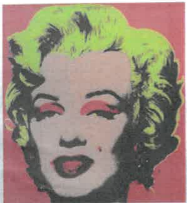
Andy Warhol - Marilyn Monroe (1962)