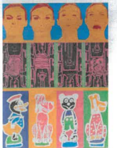
Eduardo Paolozzi (1967) Secrets of the Internal Combustion Engine